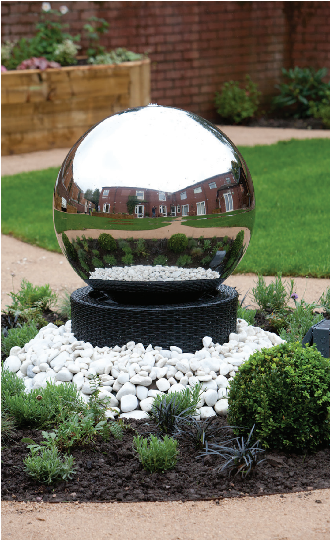
Private gardens to enjoy