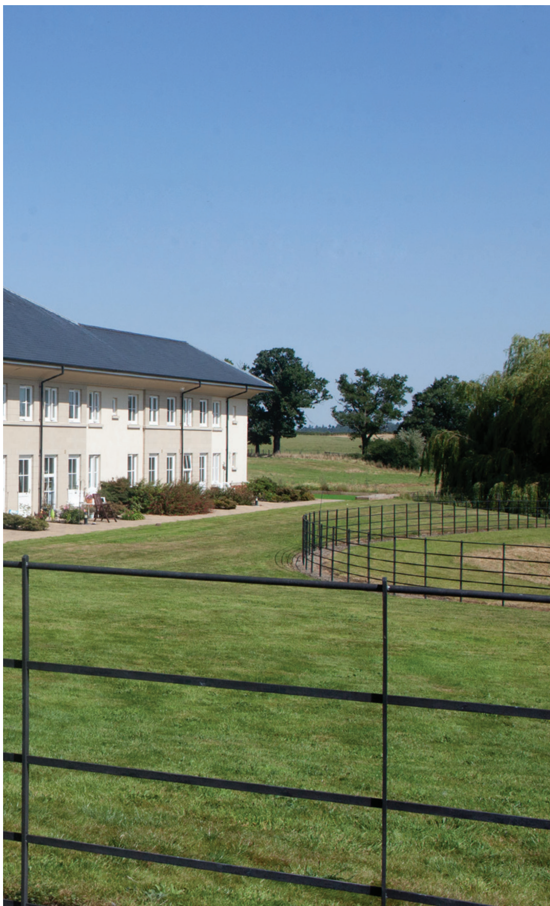
Beautiful views from your window